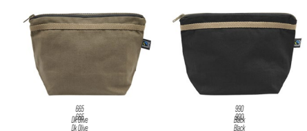
CANVAS TOILET CASE 141041 | One Size

Canvas backpack with visible front pocket. YKK zippers. Bronze colored details in metal with an antique finish. Inner pocket. Heavy adjustable carrying straps and handles. Black lining on both colors. Measurements: 28x12x38 cm, 13 l Material: 100% organic Fairtrade cotton Weight: 310 g/m²