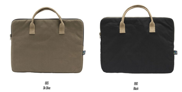
CANVAS COMPUTER CASE 141040 | 13"

Canvas bag with rounded sides. Heavy detachable and adjustable shoulder strap. Visible front pocket. YKK zippers. Bronze colored details in metal with an antique finish. Inner pocket. Black lining on both colors. Measurements: 50 cm, ø 26 cm, 25 l Material: 100% organic Fairtrade cotton Weight: 310 g/m²