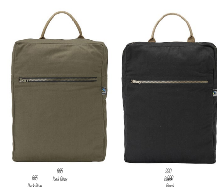
CANVAS DAYPACK 141039 | One Size

We always need to bring stuff with us. To work, from school, The toothbrush, the computer, groceries. Necessities or just good-to-have stuff. Cottover has a small collection of the most essential carriers, plain and affordable, perfect for big print. And if not branded, the Fairtrade tag sends it own clear message.