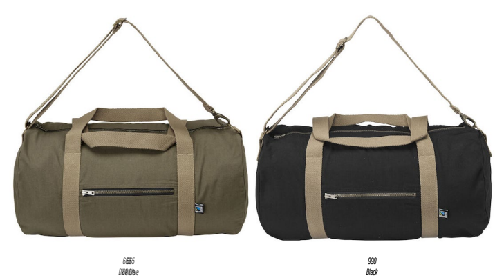
CANVAS DUFFLEBAG 141034 | One Size

Small toiletry bag, one large compartment and two inside pockets. Bronze colored YKK zipper in metal with an antique finish. Black lining on both colors. Measurements: 16x10x17 cm Material: 100% organic Fairtrade cotton Weight: 310 g/m²