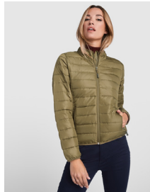
FINLAND WOMAN R5095