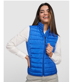
OSLO WOMAN RA5092